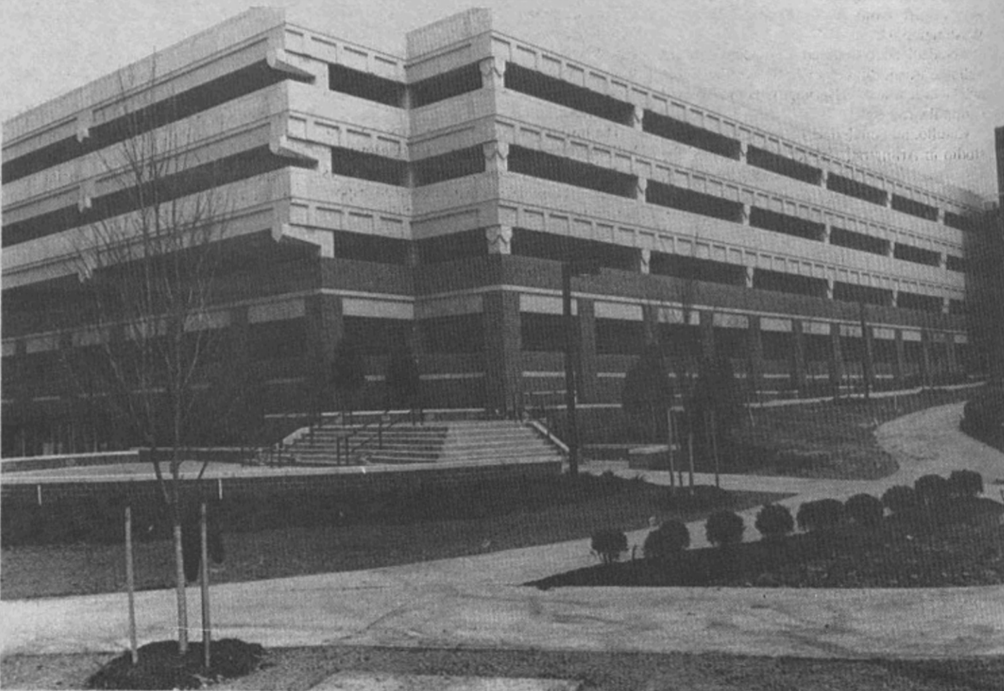
George Mason's new parking deck is open to the public.