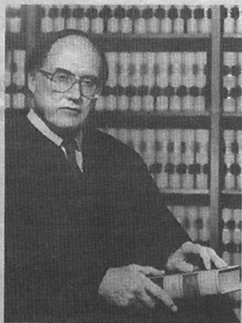
Chief Justice William H. Rehnquist